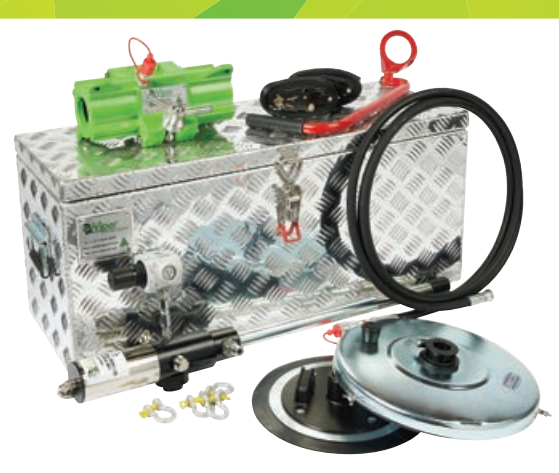
*Note Seals are sold separately